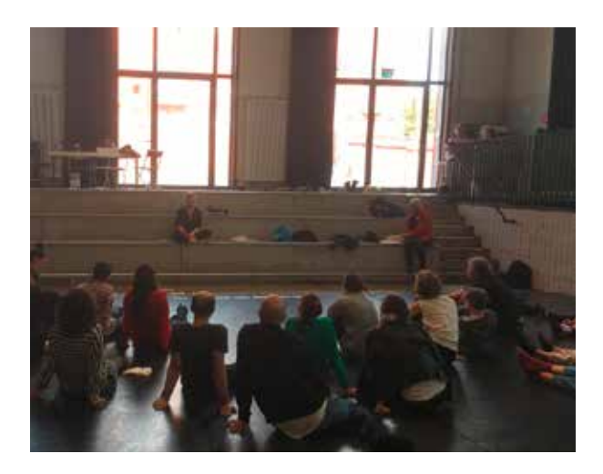
Friday Sharing

This concept was more or less successful, depending on the groups. The challenges inherent in the selforganisation of a group often took up a lot of space, to the detriment of the actual research itself. However, this could also be regarded as a useful insight or as having generated useful questions about ways of working. Personally, all the "failures" that we encountered in our groups and that might have been frustrating at the time, revealed themselves to be valuable insights into the nature of the working process and also into my own nature, my needs and desires as a person and an artist.